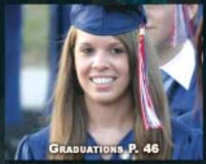
GRADUATIONS P. 46

PRSR STD U.S. Postage PAID Permit No. 450 Chatt., TN 37421